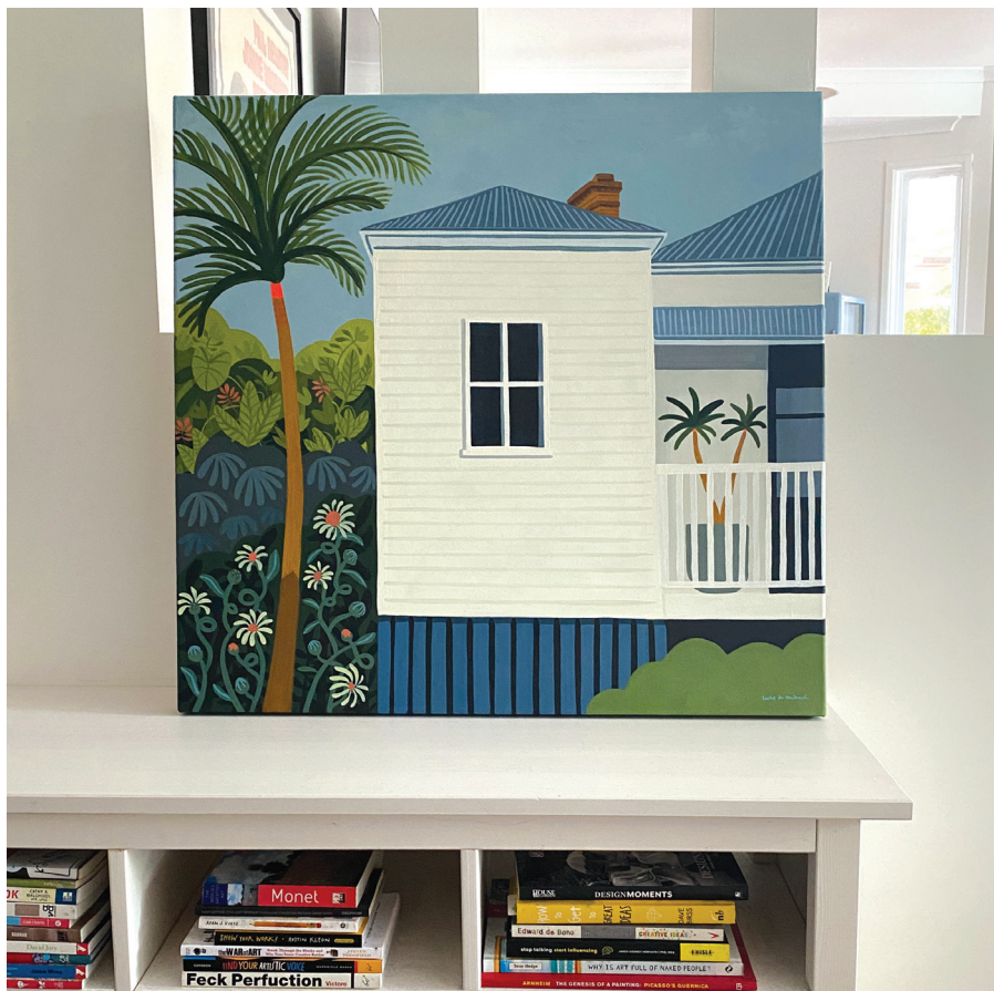
Above: Window Shopping III 30x30" (76x76cm) Acrylic on canvas