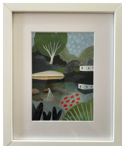
Above: Two Old Friends (study) 5x7" (13x17cm) Acrylic on 300gsm paper