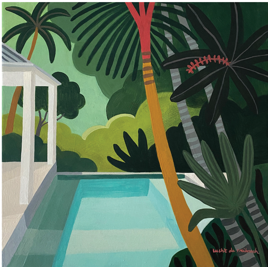
Above: Best Kept Secret 12x12" (30x30cm) Acrylic on canvas