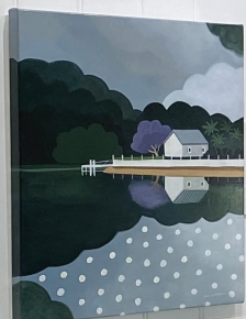
House 1970 $1,200