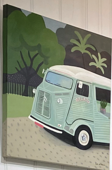
Van 1970 $1,200