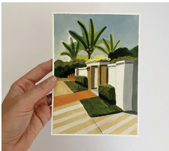
Right: Fascinator (study) 5x7" (13x17cm) Acrylic on 300gsm paper