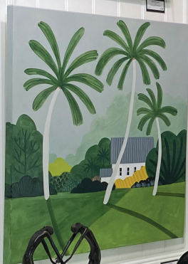
House 1970 $1,200