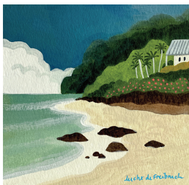
Right: Sea, Sets and Sun (study) 5x5" (13x13cm) Acrylic on 300gsm paper