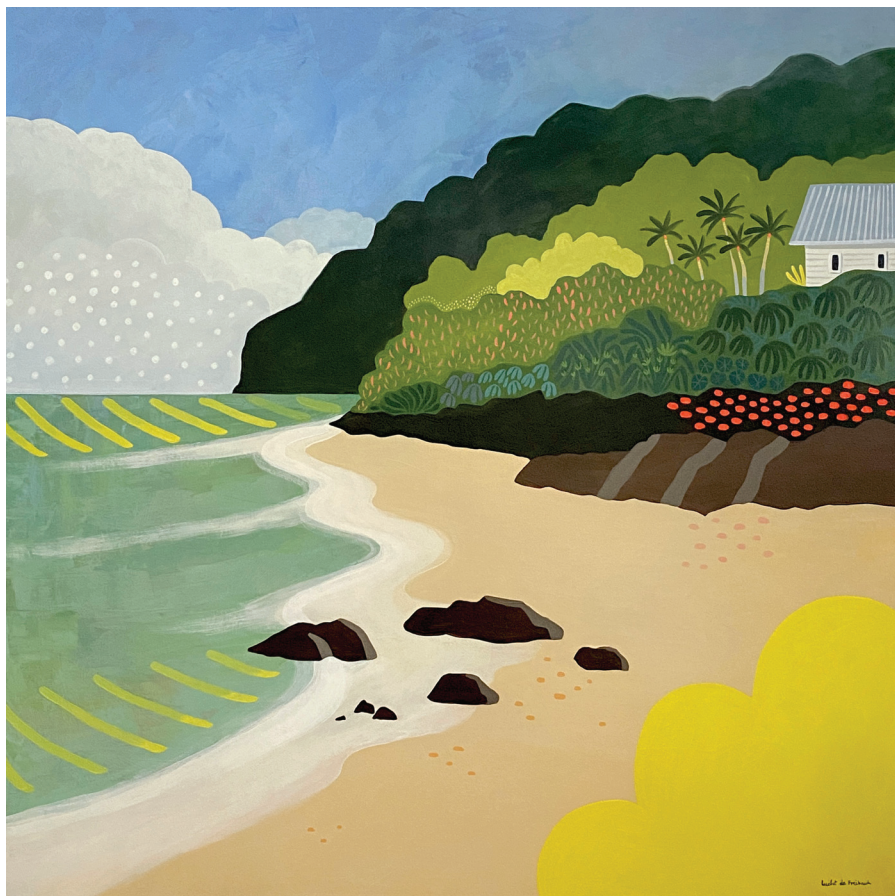
Above: Sea, Sets and Sun 40x40" (101x101cm) Acrylic on canvas