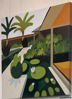
House 1970 $1,200