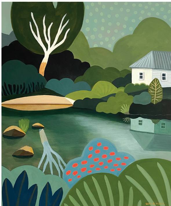
Two Old Friends 20x24" (51x61cm) Acrylic on canvas