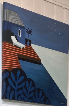
House 1970 $1,200