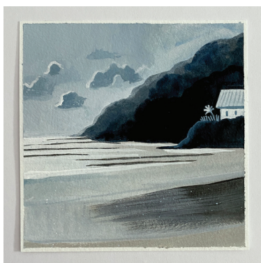
Left: Every Cloud (study) 5x5" (13x13cm) Acrylic on 300gsm paper