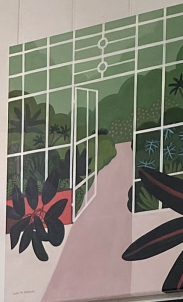
House 1970 $1,200