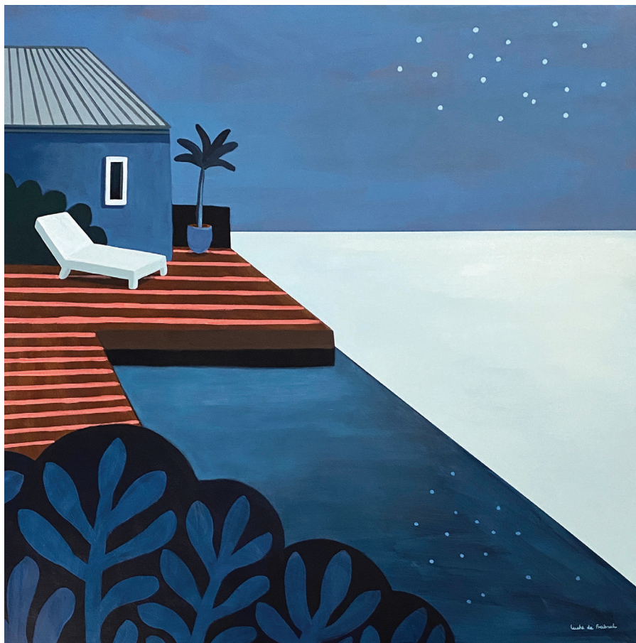
Above: Moonlight Shadow 30x30" (76x76cm) Acrylic on canvas