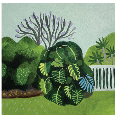
Left: As Big As Umbrellas 5x5" (13x13cm) Acrylic on 300gsm paper